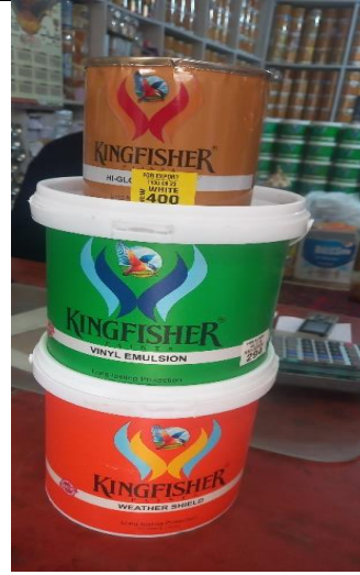
Oil Paint (Kingfisher)