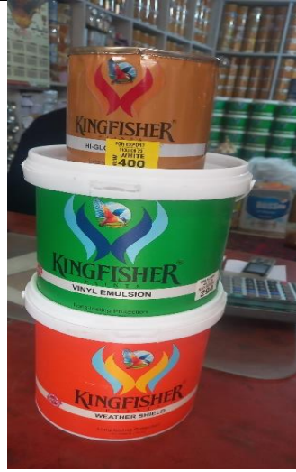
Kingfisher weather shield 6 Kg