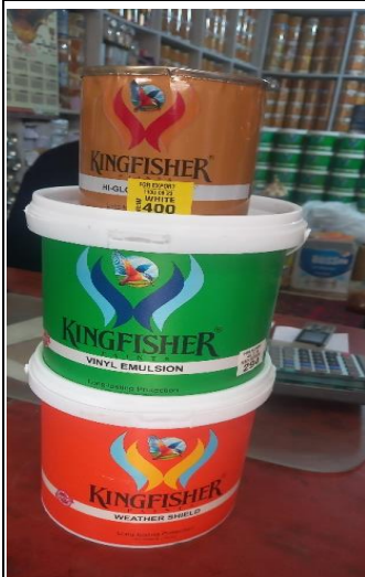
Kingfisher vinyl emulsion 6 Kg