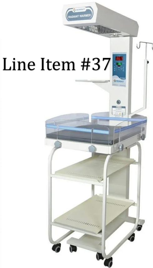
Line Item #37